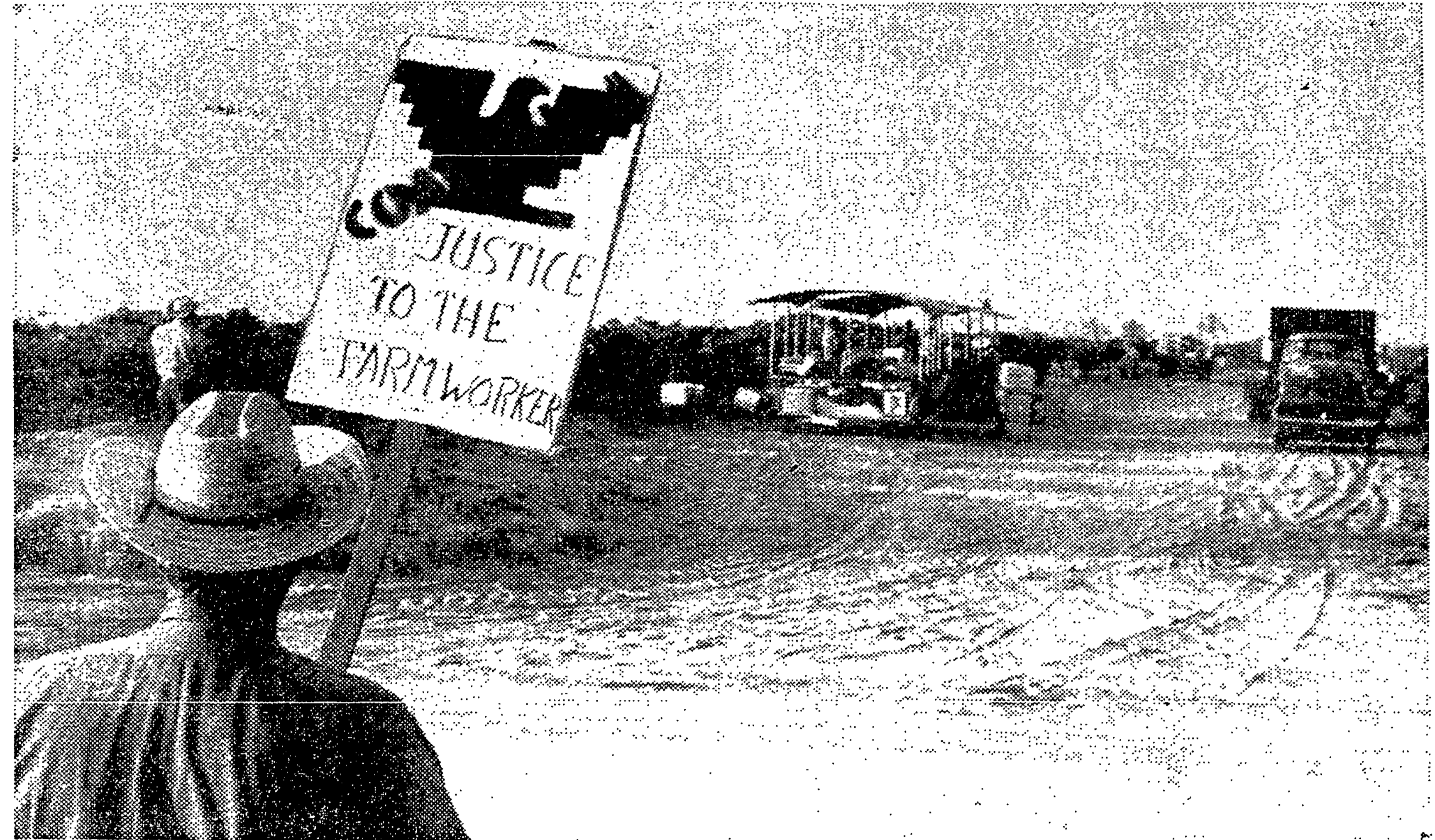
Member of United Farm Workers picketing vineyards in Coachella Valley in California as nonunion workers pack

More than four years ago the Farm Workers Union called a strike against the grape